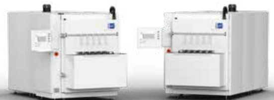
Securo | Functional Test