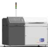
Nexus | Contact Soldering