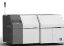
Condensol | Vapor Phase Soldering