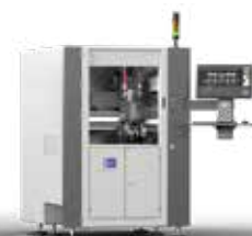
Protecto | Coating