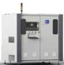
RDS | Drying