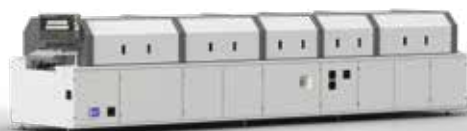
VisionX | Convection Soldering